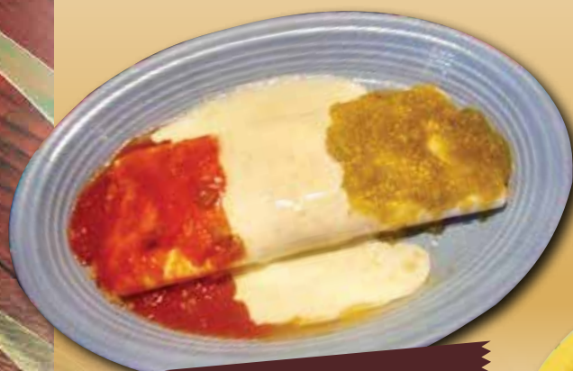
16. Burrito de México

Covered with red sauce – 4.95 Add cheese dip – 1.50