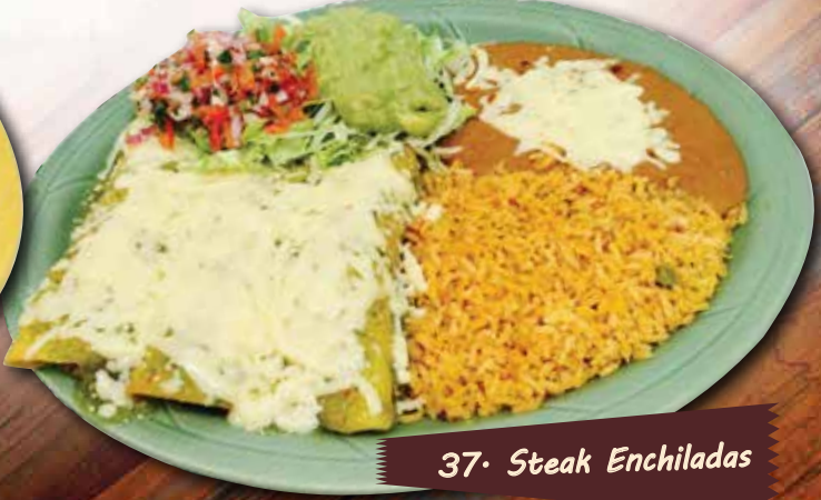
37. Steak Enchiladas