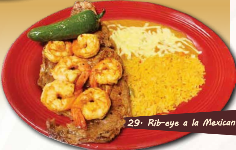
29. Rib-eye a la Mexicana