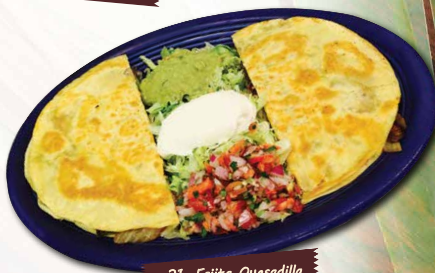
21. Fajita Quesadilla