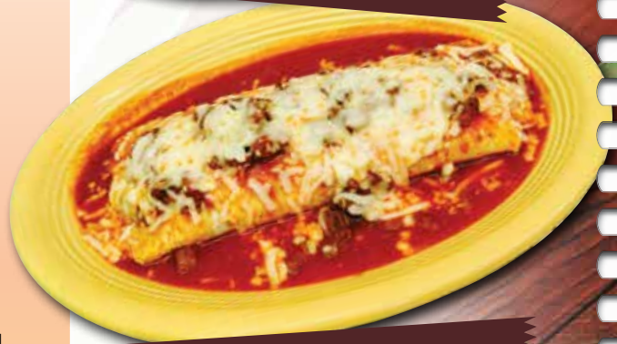
SP4. Hot and Spicy Burrito