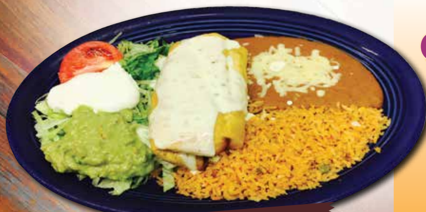
22. Fajita Chimichanga