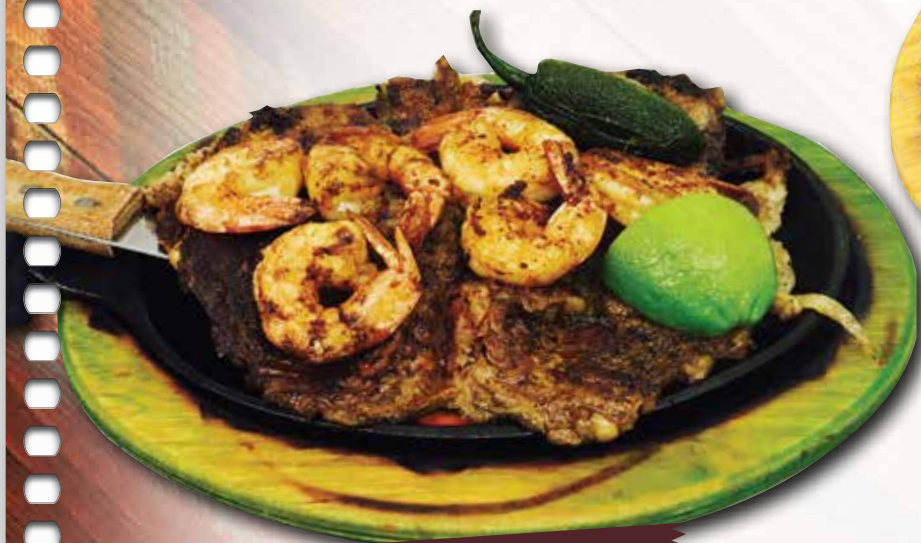
40. Carne Asada with Shrimp