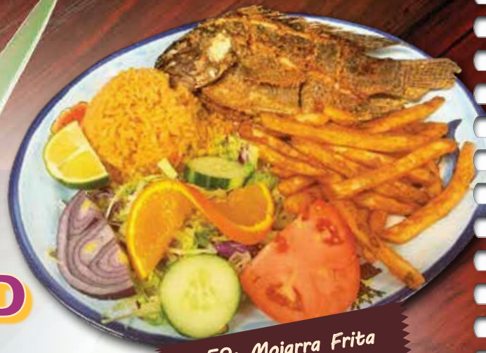
59. Mojarra Frita