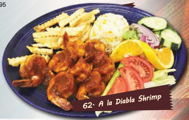
62. A la Diabla Shrimp