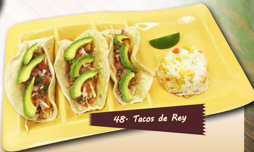
48. Tacos de Rey