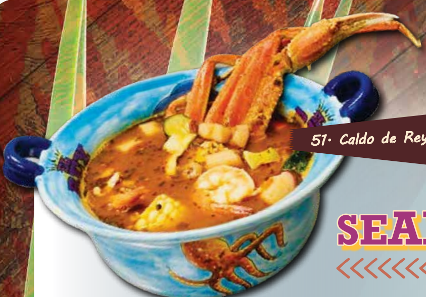
51. Caldo de Rey