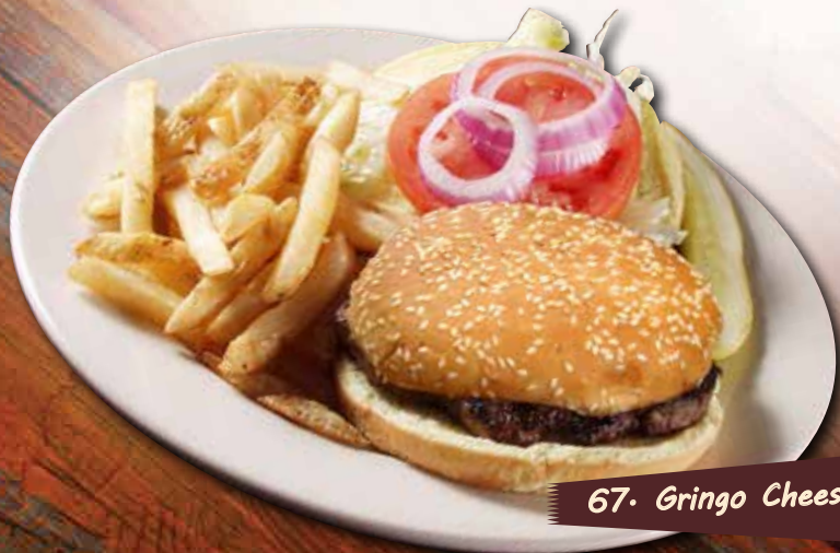
67. Gringo Cheeseburger