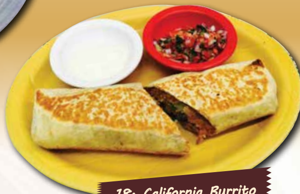
18. California Burrito

Grilled steak, chicken, shrimp, barbacoa, carnitas, pastor or chorizo. Filled with rice, onion, cilantro and cheese. Served with sour cream and pico de gallo – 14.95