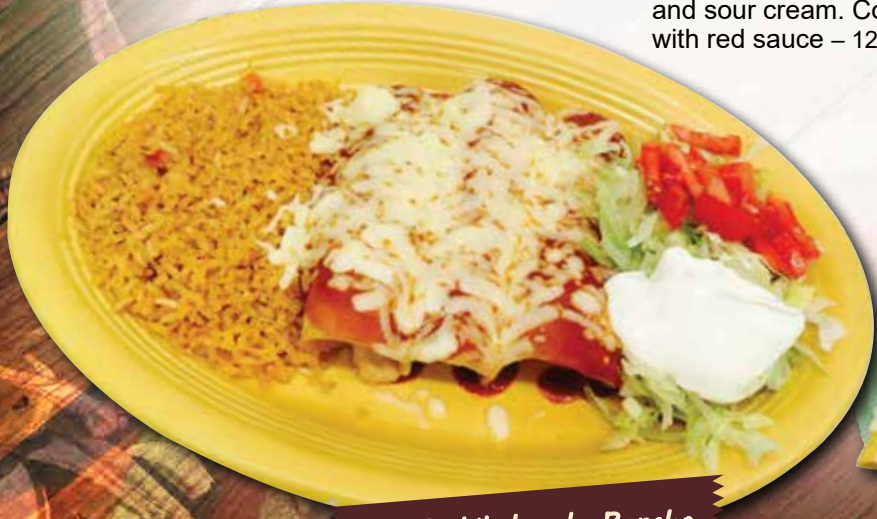
31. Enchiladas de Rancho

Three steak enchiladas covered in verde sauce. Served with rice, beans, lettuce, guacamole and pico de gallo – 14.95