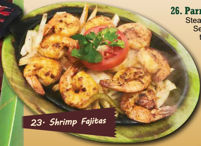
23. Shrimp Fajitas

Served with rice, beans, lettuce, tomatoes, sour cream, guacamole, pico de gallo and tortillas. Cooked with tomatoes, onions and bell peppers.