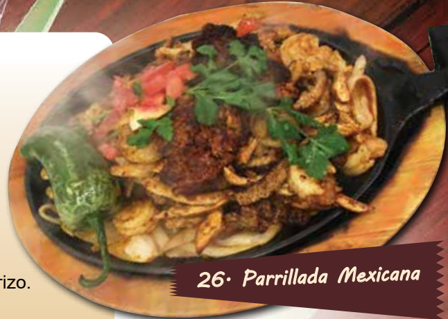
26. Parrillada Mexicana