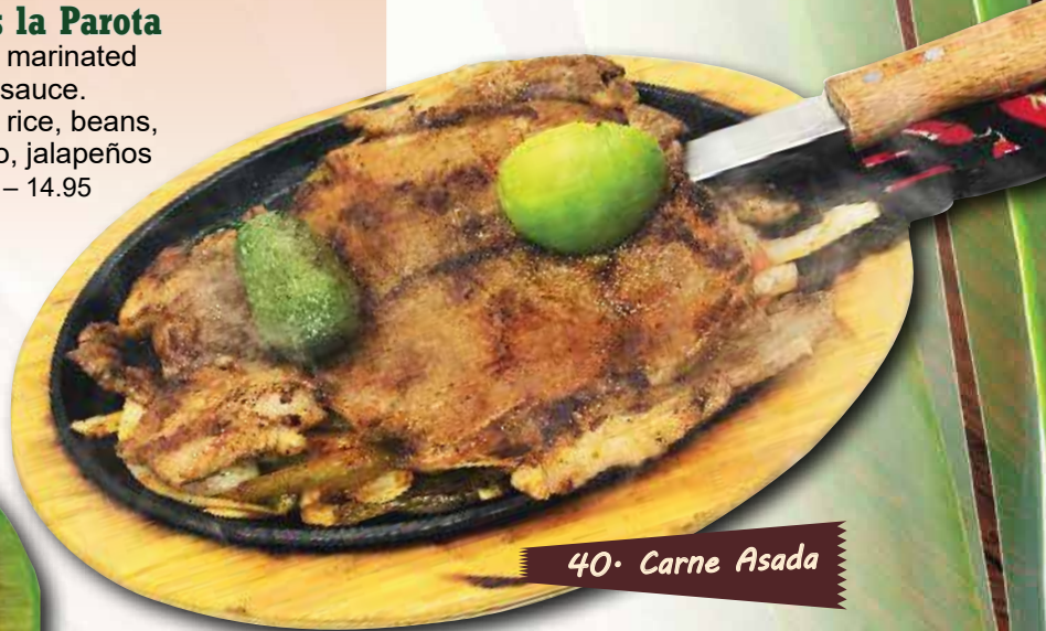
40. Carne Asada