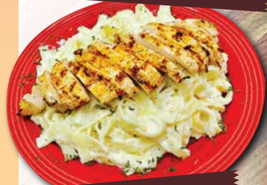
L. Chicken Alfredo Pasta

All take out orders, 25¢ extra per item.