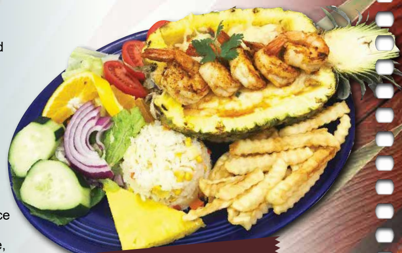
60. Piña Rellena