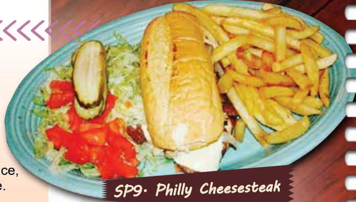
SP9. Philly Cheesesteak

Nopales con huevos en mole rojo. Served with rice, beans and tortillas – 9.95